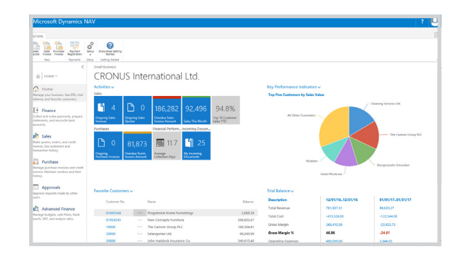
Figure 3.2: Microsoft Dynamics NAV comes with a wide variety of customized charts out of the box

> Change data interactively and visualize potential consequences for chosen actions within the sales process: How is my overall order status?