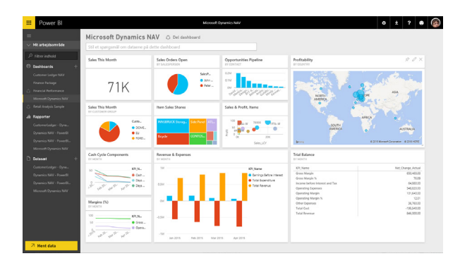
Figure 4: PowerView & PowerBl.com views

The dashboard and reports are built on top of a fully featured model, allowing you to explore and analyze your data as you need. Automatic refresh will ensure you're always seeing the latest data