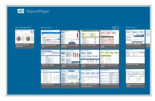
Figure 5: The Report Library provides easy overview of your Microsoft Excel reports right from your desktop

You can also use the Report Player to get fast access to your reports in Microsoft Office Excel as well as get a quick overview of progress or latest's update right on your desktop. Go to the Windows 8 app store to download the app.